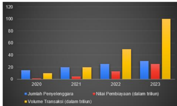
Table. 2 Development of Sharia Fintech in 2020-2023

Sharia fintech has great potential to contribute to national economic development, such as increasing financial inclusion. According to the Financial Services Authority (OJK), financial inclusion in Indonesia in 2022 will reach 76.19%. This figure shows a significant increase from 2021 which only reached 73.8%. Sharia fintech contributes to increasing financial inclusion in Indonesia. In 2022, the value of sharia fintech transactions reached IDR 6,732.6 million. This number increased by 58.26% from the previous year.