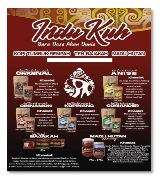
Figure 5. Design for Market Place Local Content Drinks Indu Kuh

Names of Indu Kuh means My Mother's Name. This product by Micro Enterprises not only promo and sell the product but also promotes Dayaknese words.