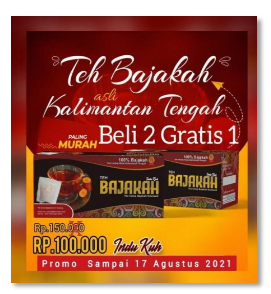
Figure 6. Design for Market Place Local Content Tea Herbal Drinks

Names of Indu Kuh means My Mother's Name. This product by Micro Enterprises not only promo and sell the product but also promotes Dayaknese words.