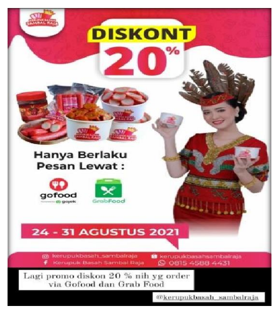
Figure 3. Design for Market Place Local Content Local Snack Kerupuk Ikan Pipih.

Traditional costumes were worn by the model show characteristics of local cultural content. The model wears a traditional headband decorated with Bulu Burung Tinggang (The feathers of Tinggang birds). Tinggang birds are bird species that are only available on Borneo Island.