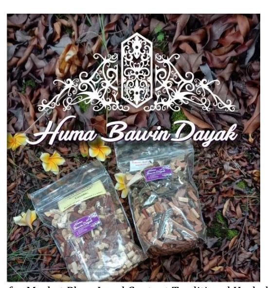
Figure 4. Design for Market Place Local Content Traditional Herbal Drinks of Huma Bawin Dayak

Traditional costumes were worn by the model show characteristics of local cultural content. The model wears a traditional headband decorated with Bulu Burung Tinggang (The feathers of Tinggang birds). Tinggang birds are bird species that are only available on Borneo Island.